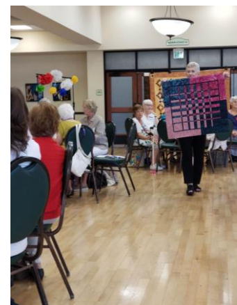
Mona's Sample Quilt