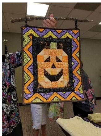
Polly's wall hanging